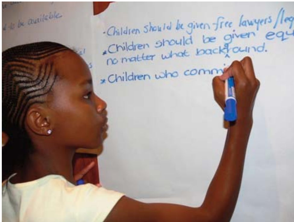
The children collecting their ideas.

The 17th of October 2007 marked the beginning of the Children's Consultation on the follow-up to the UN study on Violence against Children in Lusaka, Zambia. Two delegates from five countries in the Southern African region, that is, Zambia, Botswana, Lesotho, Swaziland and South Africa, have been chosen to come up with presentations for the World Wide Day of Action against Violence that falls on the 19th of October 2007.